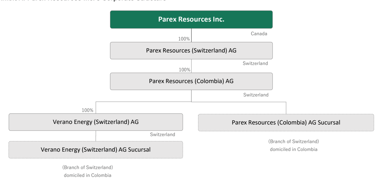
Exhibit A: Parex Resources Inc.'s Corporate Structure

The above organizational structure facilitates Parex's business as a multi-jurisdictional company whose operations are located outside of Canada. The Company has two subsidiaries in Switzerland whose activities are each conducted in Colombia through Colombian branches. Conducting business through a Colombian branch minimizes the corporate organizational burden in Colombia. The Company currently has two Colombian branches, through which all the Company's activities in Colombia are conducted.